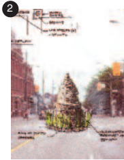
Project Beacon William Hudson Parliament St. at Winchester

Nuit Blanche is an all night celebration of contemporary art held city wide for one night, and for the first time including Cabbagetown and its contemporary artists. For one sleepless night, experience Cabbagetown transformed by 14 artists. Discover art in parks, alleyways, on streets, in parking lots and unexpected places. From sunset at 7:00 pm on Sat. Oct. 4, to sunrise at 7:00 am on Sun., Cabbagetown & across the city, will be bustling with activity as thousands experience an amazing full night of contemporary art and performance. Contact us at cabbagetownnuitblanche@gmail.com to volunteer, donate or to get involved. www.cabbagetownnuitblanche.ca to see the artists and art.